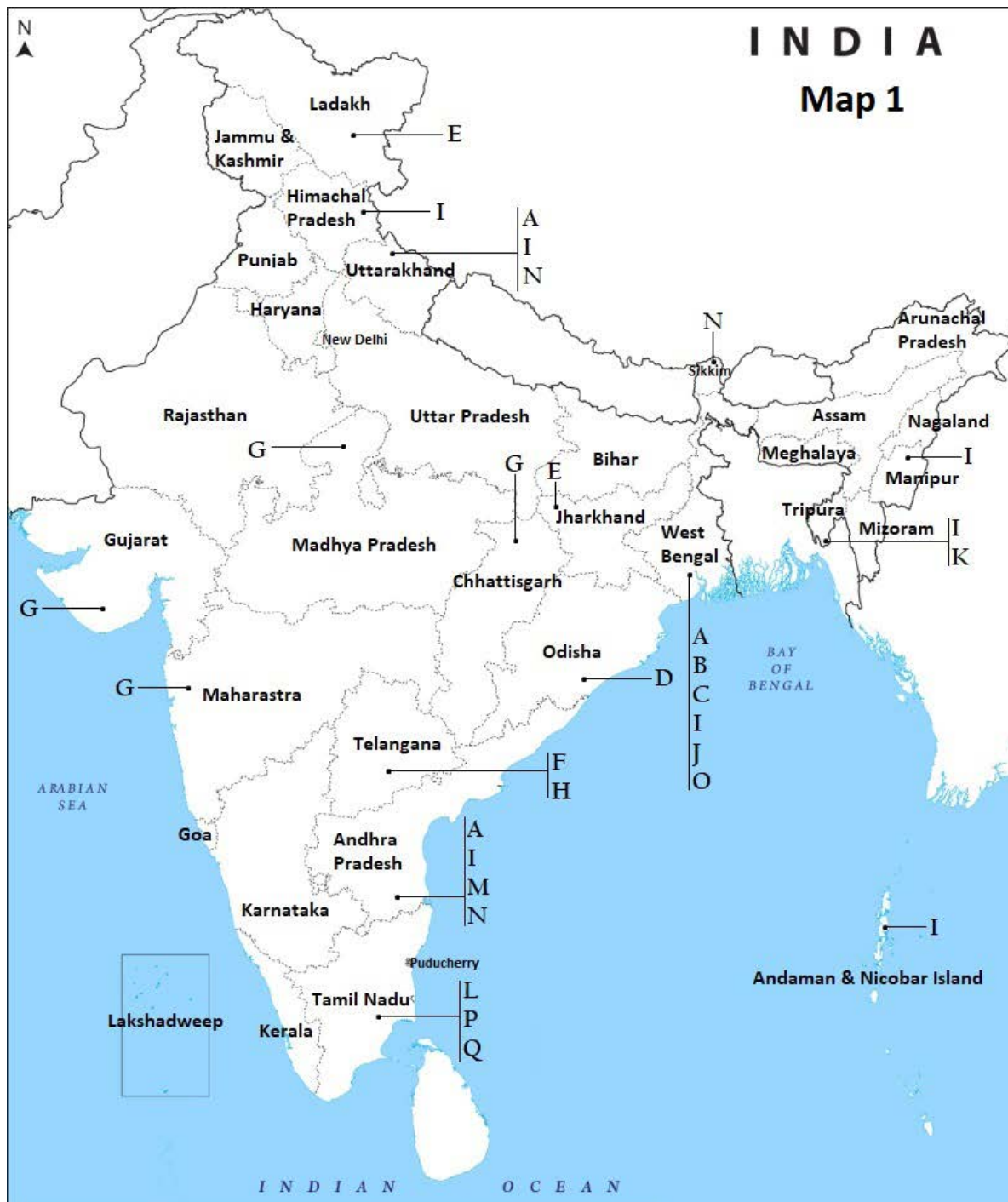
Map 1: Known geographical distribution of the Zygentoma species in India.

A. Acrotelsa collaris ; B. Acrotelsella jhargramensis ; C. Acrotelsella wygodzinskyi ; D. Afrolepisma nigrina ; E. Ctenolepisma (C.) alticola ; F. Ctenolepisma (C.) amrabadense ; G. Ctenolepisma (C.) boettgerianum ; H. Ctenolepisma (C.) kawalense ; I. Ctenolepisma (C.) longicaudatum ; J. Ctenolepisma (C.) nigrum ; K. Ctenolepisma (C.) tripurensis ; L. Ctenolepisma (C.) udumalpetense ; M. Ctenolepisma (C.) venkataramani ; N. Lepisma saccharina ; O. Tricholepisma gravelyi ; P. Xenolepisma subnigrina ; Q. Thermobia domestica .