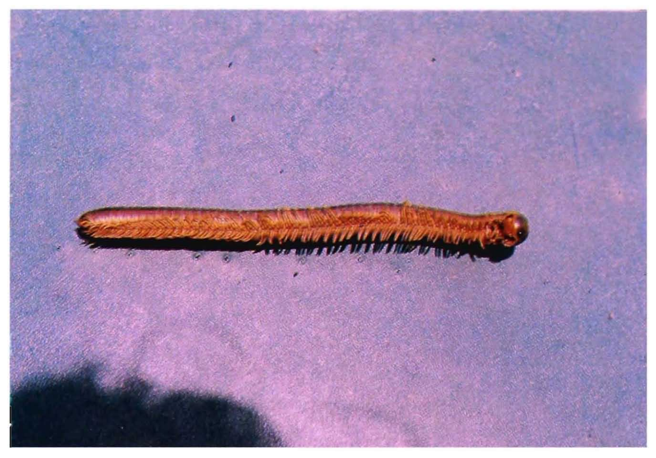
Fig. II Dorsal and Ventral view of Millipede Phyllogonostreptus nigrolabiatus Newport