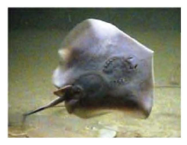
Fig. 1: Dasyatis zugei (Muller & Henle)