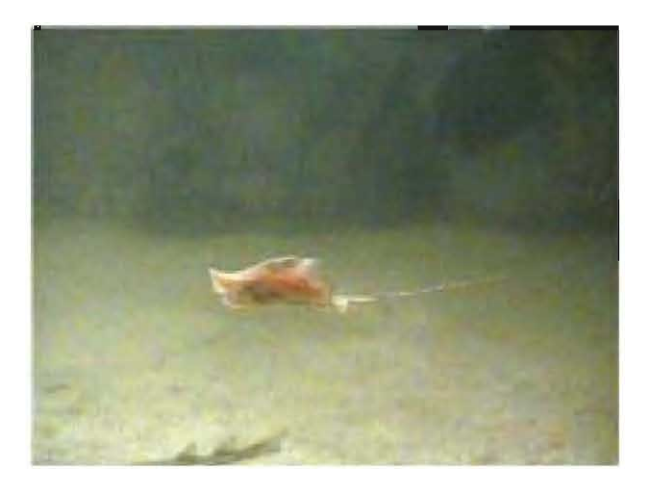
Fig. 3: Newly born pups of stingray.