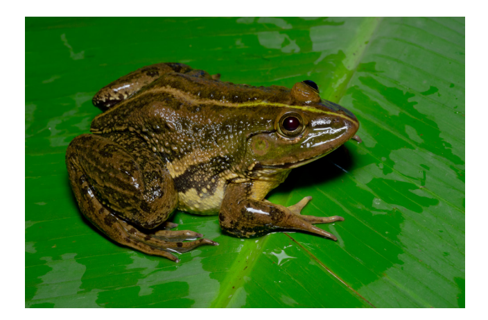
Figure 3.E. karaavali in life from Calicut township,<br/>Kozhikode, Kerala.