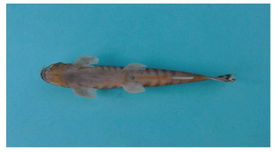
Fig. 3. Aborichthys waikhomi sp. nov. (Holotype, EBRC/ZSI/F-7414, 65.0 mm SL). a. lateral view, b. dorsal view and c. ventral view. Scale bar indicates 10 mm.