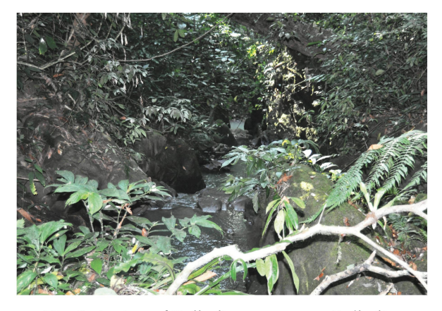
Fig. 2. A view of Bulbulia stream near Bulbulia, Namdapha, Arunachal Pradesh, India. Type locality of Aborichthys waikhomi sp. nov.