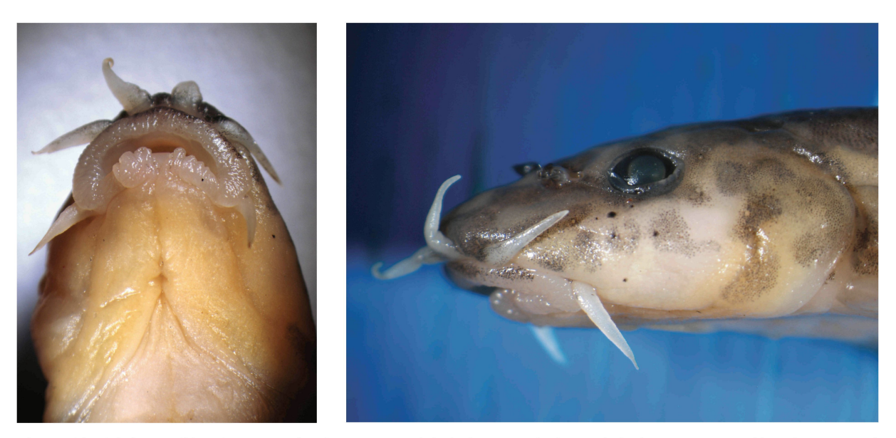
Fig. 4. Aborichthys waikhomi sp. nov. (Holotype, EBRC/ZSI/F-7414, 65.0 mm SL) close up view of head. a. ventral view; b. lateral view.