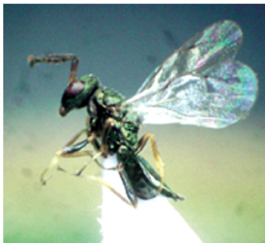
3. Pteromalus puparum (Linnaeus), female

Material examined: 1 F, Hemis N.P, N 33°54' 51.8" E 77°42' 46.4", Alt. 3568 m, Ladakh range, 5.vii.2008 (Reg.No. A.1220); 2 F, Hunder, N 34°34' 48.8" E 77°28' 45.4", Alt. 3190 m, Ladakh range, 7.vii.2008 (Reg.No.A.1225, 1227); 1F, Trishak, N 34°28' 40.11" E 77°43' 52.58", Alt. 3236 m, Nubra valley, 8.vii.2008 (Reg.No.A.1223); 2F, Sumdho, N 33°13' 51" E 78°22' 18.8", Alt. 4427 m, Changthang valley, 12.vii.2008 (Reg.No.A. 1222, 1226); 1F, 3 km to Chanthang from Mahe bridge, N 33°21' 32.7" E 78°21' 23.9", Alt. 4051 Metre Changthang valley, 12.vii.2008 (Reg.No. A.1221); 1F, Nimmu, N 34°09' 35.31" E 77°53' 20", Alt. 3535 m, Ladakh range, 5.vii.2008, (Reg.No. A.1224).