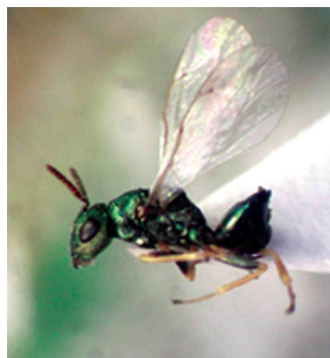
5. Halticoptera smaragdina (Curtis), female

1969. Halticoptera smaragdina (Curtis): Graham, Bull. Br. Mus.nat.Hist.Ent.Suppl. 16,159.