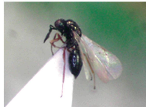
6. Asaphes suspensus (Nees), female

Diagnostic characters : Female: Length: 1.5-1.6mm. Body brownish black with metallic blue reflection, propodeum and petiole less bright; antennae black; legs except coxae testaceous, femora more or less infusate. Head and thorax with rather less numerous bristles. Pronotal collar with the