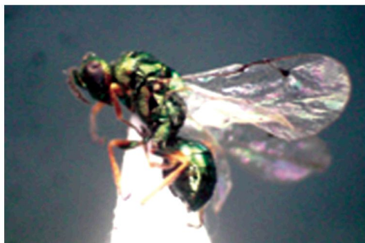
7. Sphaeripalpus lacunosus Huang, female

dark brown. Scutellum with frenum clearly marked; dorsellum punctulate. Gaster punctuate; petiole 2x as broad as long with transverse crests both anteriorly and posteriorly.