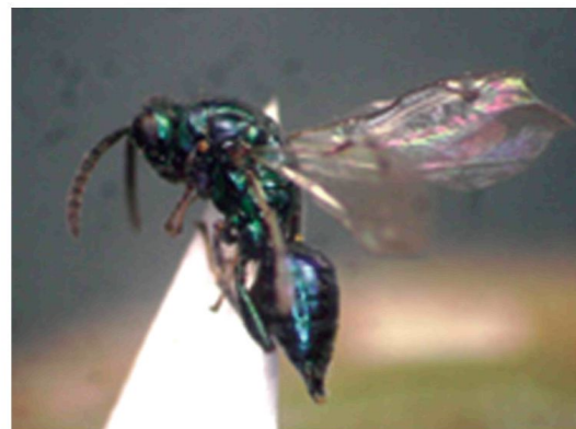
2. Lamprotatus splendens Westwood, female

Diagnostic characters : Female: Length: 3.9-4mm. Body bright metallic blue; antennae uniformly black; legs except tarsi black with metallic blue reflection, tarsi testaceous; sculptured part of gastral petiole 1.6 to 3 x as broad as long, less than half as long as the propodeum, its front edge with a sharp transverse carina. Mid femora rather stouter, excluding the trochantellus 4 to 4.5x as long as broad. Combined length of pedicellus and flagellum 1.3 to 1.4 x breadth of head, flagellum rather stouter.