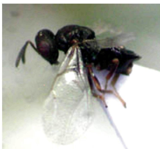
8. Schizonotus latus (Walker), female.

Diagnostic characters : Female: Length 2.4-2.5mm. Body brownish black; clypeus not projecting below level of genae; antennae dark brown with scape and pedicel testaceous, anelli together almost equal to width of second anellus; F2 1.2-1.5x as wide as long. Propodeum with distinct median carina and plicae.