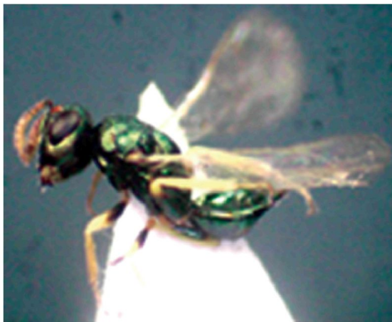
4. Halticoptera circulus (Walker), female

Diagnostic characters : Female: 1.5-1.9mm. Body dark metallic bluish green; antennae testaceous with scape and pedicel black; coxae concolorous with thorax, femora brown, remainder of legs testaceous. Forewing with apex of basal cell bare or with only a very few hairs. Pronotal collar rounded off anteriorly, reticulate with at most a very narrow shiny strip along its hind margin. Propodeum almost shiny; gastral petiole strongly reticulate with median carina.