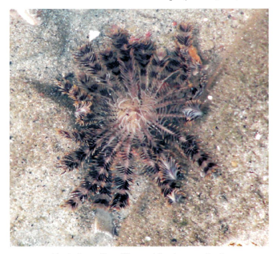
Fig. 1: Comatella stelligera on Murudeswar seabeach