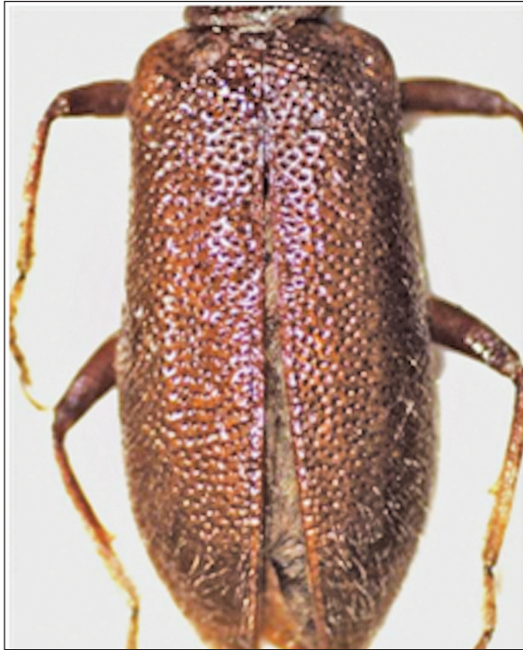
Elytra showing punctation and Pubescence