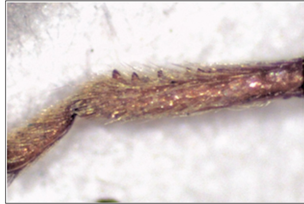
Right middle leg showing the presence of tooth

Material examined: Uttarakhand, Trijugi Narayan, Rudra Prayag, 1.vii.2004, (1ex.) coll.: S.K. Chakraborty and party; deposited in NZC, Zoological Survey of India, Kolkata. Reg. No. 19967/ H4A.