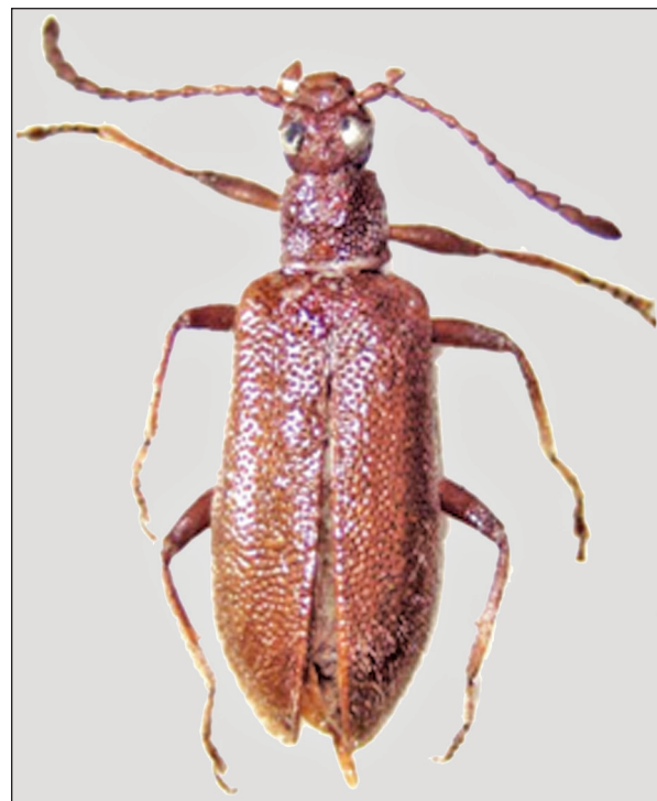
Bothynogria ruficollis (Hope, 1831)

infusate. Antennae relatively long, 8 th and 9 th segments distinctly elongate, and last segment longest. Pronotum slightly wider than long, impression shallow, punctures large. Elytra distinctly flattened, hardly widening posteriorly, punctures deeply impressed, elytral pubescence sparse, short reclinate. Legs strong, middle and hind legs with tooth like structure in B. ruficollis . The inner edge of the middle leg with denticles, prominent tooth last in the series.